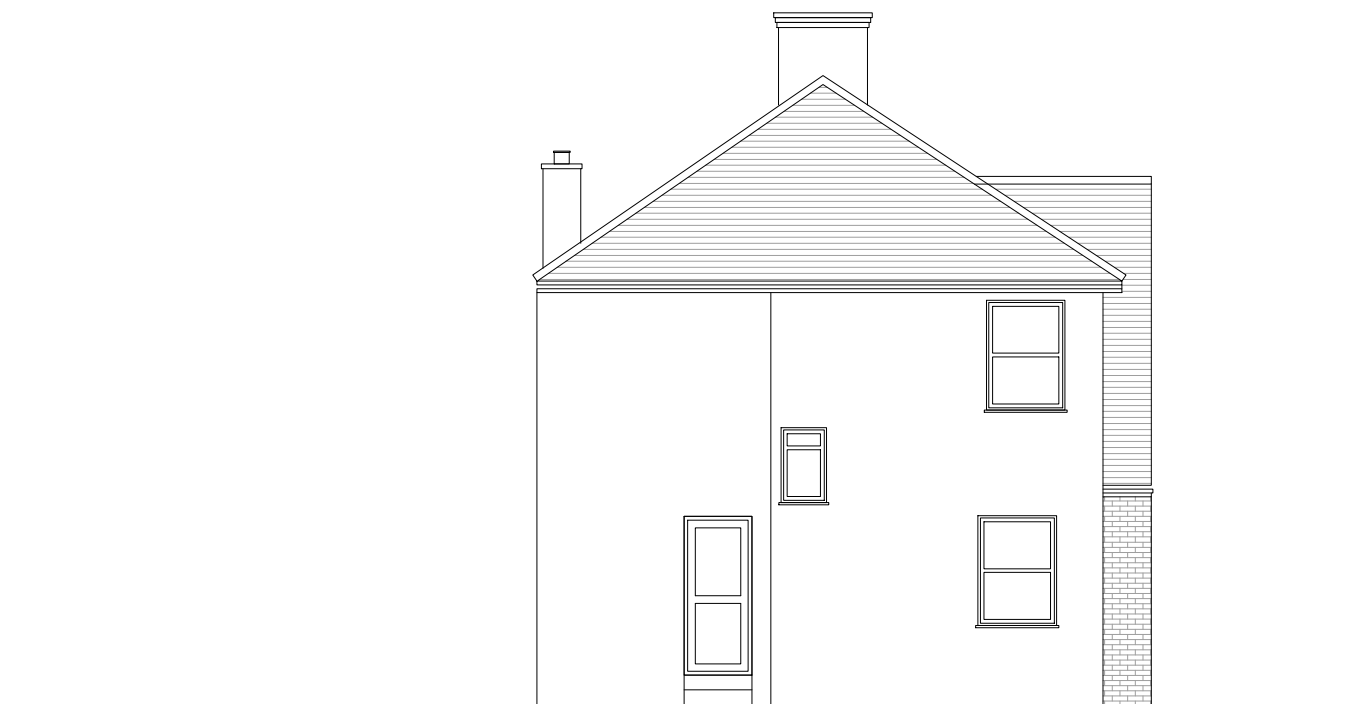
EXISTING SECTION AA