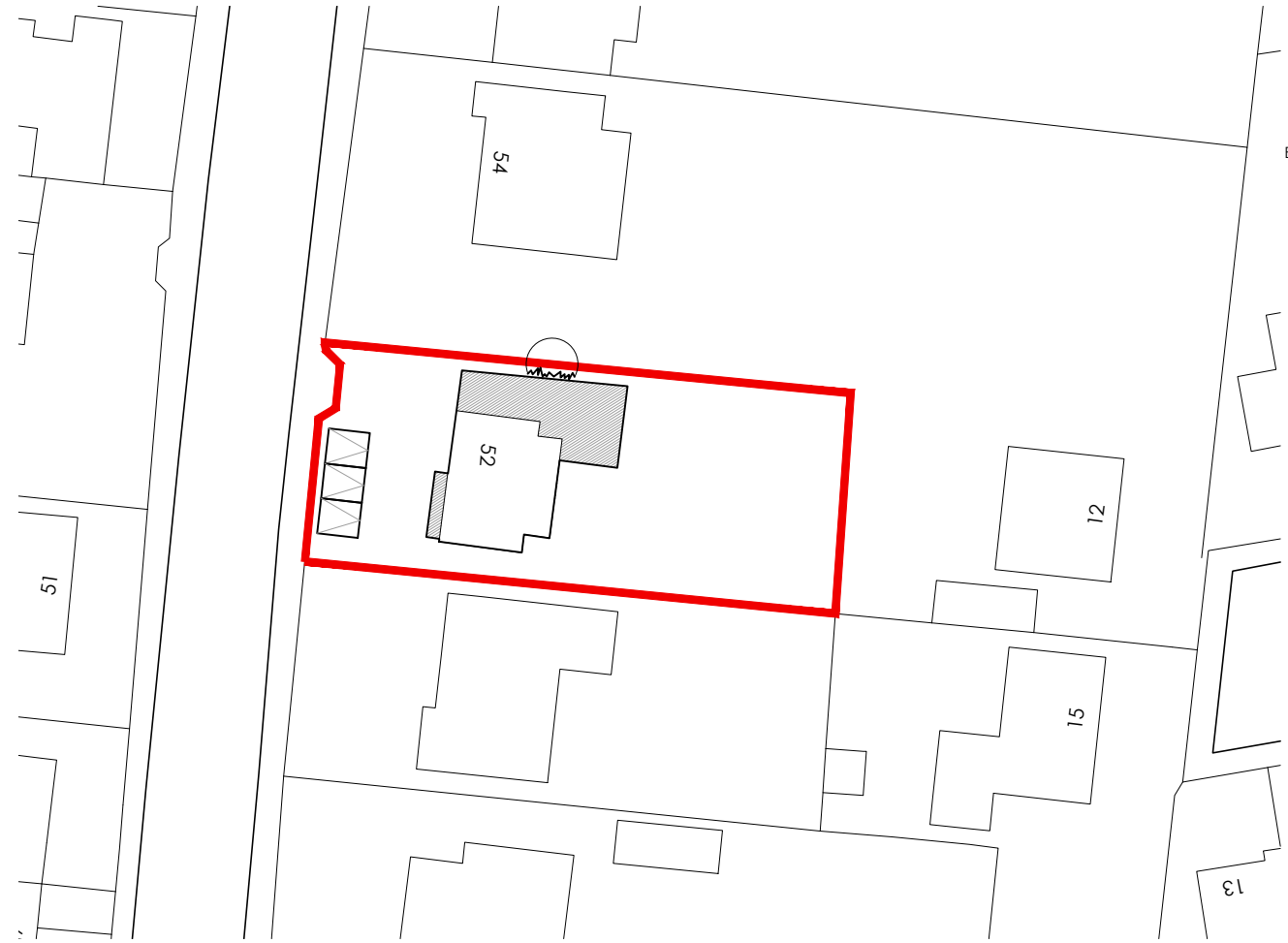
PROPOSED BLOCK PLAN SCALE 1:500 @ A3