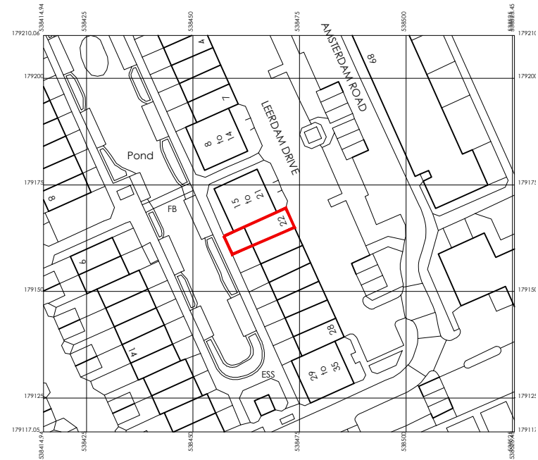
LOCATION PLAN SCALE 1:1250 @ A3

© Crown copyright and database rights 2018 OS 100053143 Reproduction in whole or part is prohibited without the prior permission of Ordnance Survey.